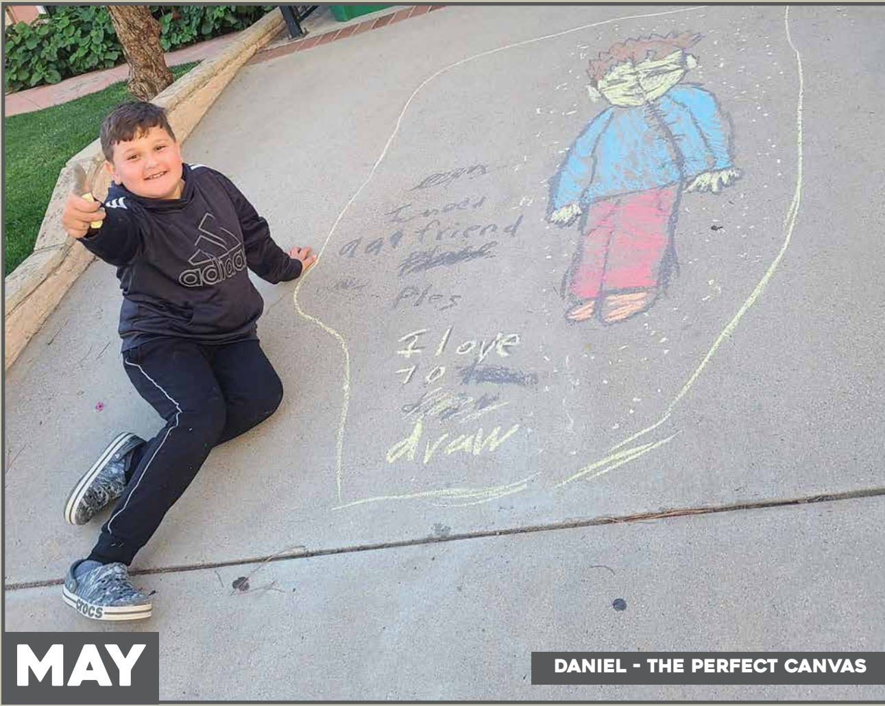
DANIEL - THE PERFECT CANVAS