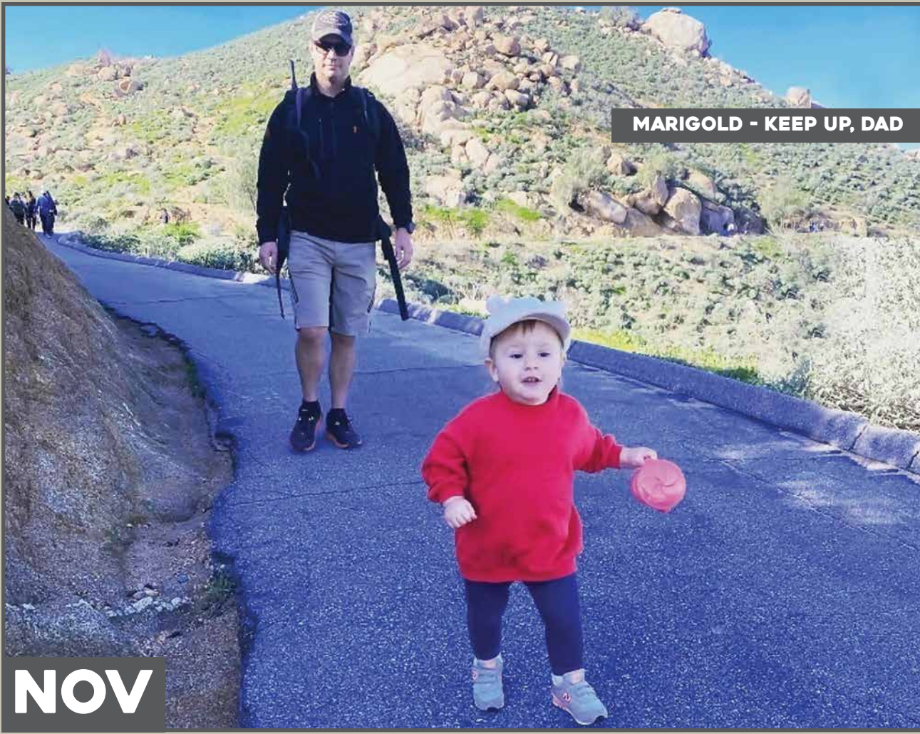
MARIGOLD - KEEP UP, DAD